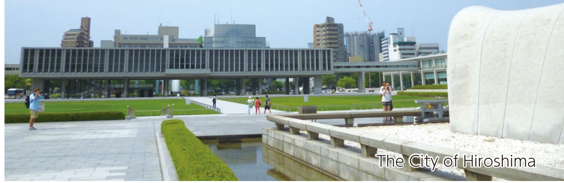
The City of Hiroshima

Hiroshima Peace Memorial Museum and city center areas