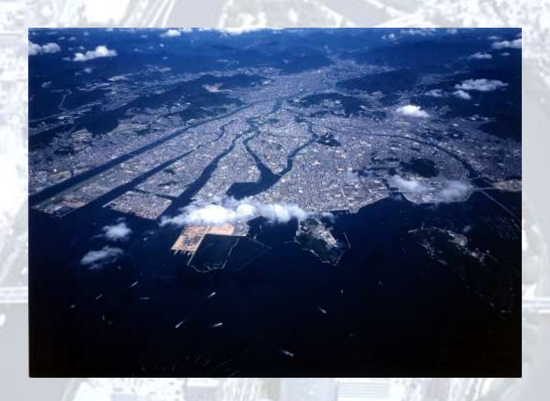
The City of Hiroshima

Hiroshima was reconstructed in accordance with the law and the plan, which even today serve as the basis for town planning.