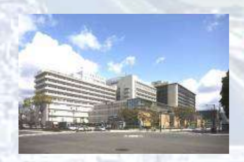
Fig. 7 Hiroshima Citizen's Hospital

These are examples of facilities constructed on the land donated by the national government.