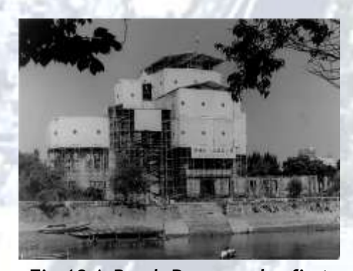
Fig. 10 A-Bomb Dome under first preservation work (1967)

Preservation work of the A-Bomb Dome was carried out three times (1967, 1990, 2002) funded largely by the donations of private citizens. And, As well, Hiroshima Municipal Baseball Stadium was built in 1958 as center of sports with the donations of local financial circles.