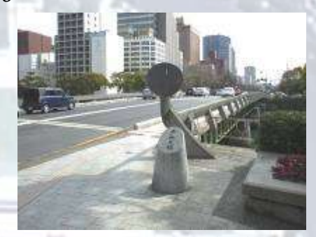
Fig. 5 Present Heiwa-ohashi Bridge

In May 2000, Bank of Japan made a decision to donate land and building of former Hiroshima office to the City of Hiroshima without compensation on condition that this building is designated as a national important cultural property.