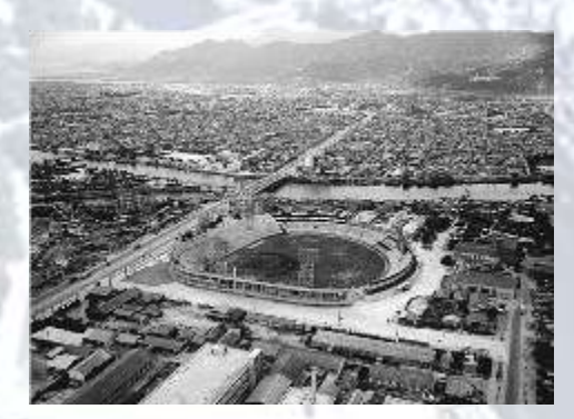
Fig. 11 Hiroshima Municipal Baseball Stadium after completion (1958)