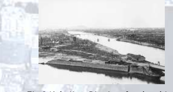
Fig. 2 Nakajima District after bombing

The Nakajima District is located in the center of the City and lies between the two rivers, the Motoyasugawa and the Honkawa. It was formerly one of the city's main business districts. In 1946, much of this area was set aside as Nakajima Park under the Hiroshima