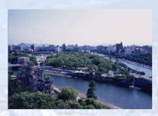
Fig. 3 Present Nakajima District

In accordance with the Town Planning Law, the Park and the Atomic Bomb Dome were designated as a memorial to world peace.