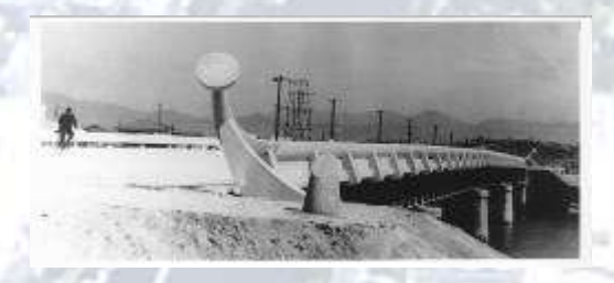
Fig. 4 Heiwa-ohashi Bridge (1952)

In 1952, Heiwa-ohashi Bridge and Nishi-heiwa-ohashi Bridge were constructed under direct control of the national government. The railings of these bridges were designed by world famous Japanese-American Sculptor Isamu Noguchi .