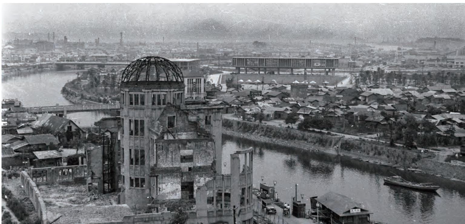
Hiroshima Peace Memorial Park Under Construction, the View from the Hiroshima Chamber of Commerce and Industry Building August 5, 1953

This exhibition will be held in conjunction with the G7 Summit in Hiroshima and take a look at the history of Hiroshima: its development as a castle town before the bombing, brave recovery from the ashes of the atomic bombing, and its current state as a peace memorial city that conveys the reality of the atomic bombing and appeals for peace. The exhibit will focus on the different eras of Hiroshima's history as seen through changes in the cityscape, as well as the lives of the citizens, using materials such as photos and illustrated maps.