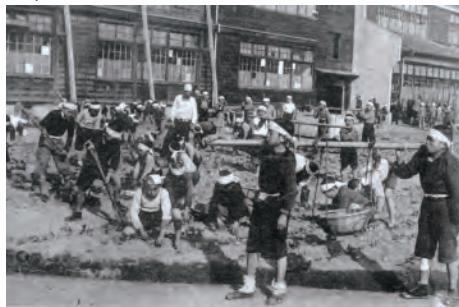
Children Cropped a Field in the Schoolyard