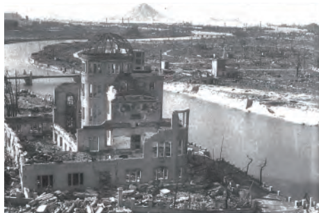
Hiroshima After the Atomic Bombing