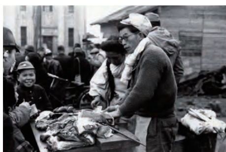
Black Market at Matsubara-cho Along the Rale of Streetcars