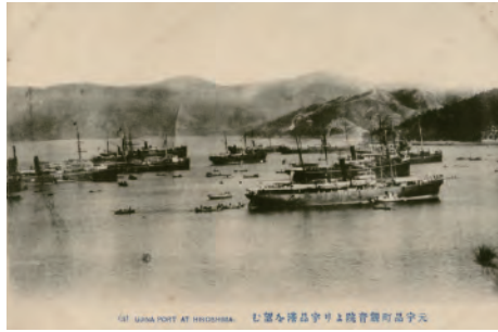
Ujina ; Port of Embarkation for Troops to China