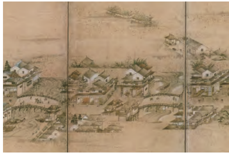
The Prospering Nakajima-hon-machi Collection of Hiroshima Castle