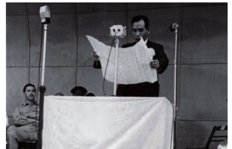
Hamai Shinzo, the Mayor of Hiroshima Presenting His Peace Declaration at the First Peace Festival