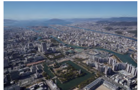
The View of Hiroshima Castle and Central Hiroshima City from Northeast