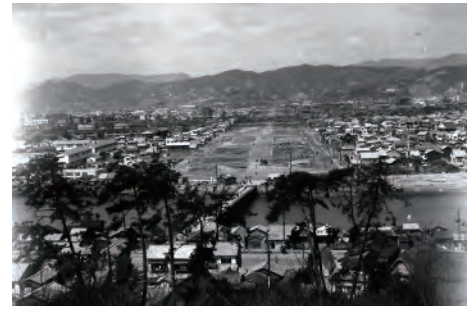
The View of 100-meter Road from Mt. Hijiya