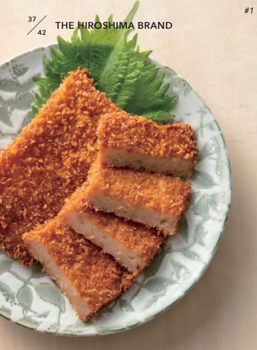
37 / 42 THE HIROSHIMA BRAND