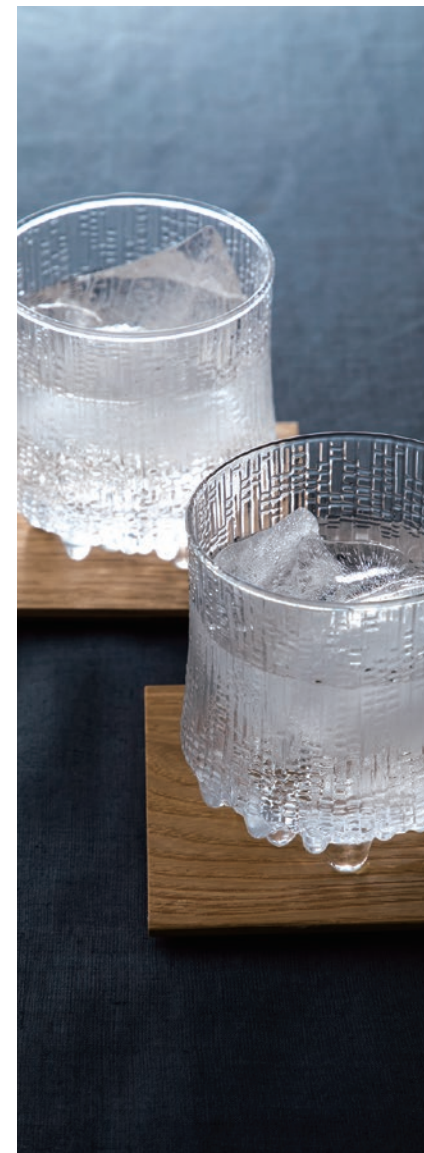
Drinks/Alcohol #3 Daruma Beni Azuma Authentic Sweet Potato Shōchū

The stunning sweetness of 100% Hiroshima-grown sweet potatoes