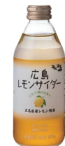
Drinks/Alcohol #4 Hiroshima Lemon Cider with Amabito no Moshio Fisherman's Salt

A delightful local cider made with Hiroshima lemon juice