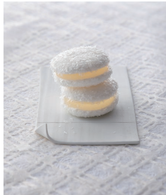
Confections/Snacks #9 Awasetsuma

A unique confection with a trio of great textures and the brightness of Hiroshima lemons