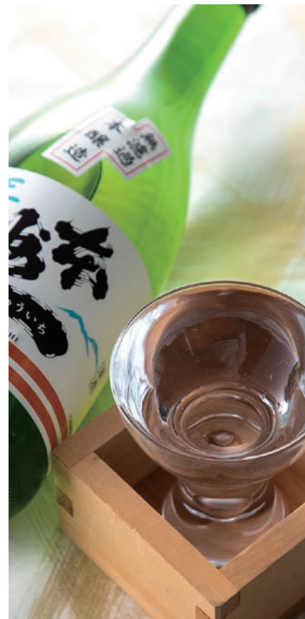
Drinks/Alcohol #1 Honshū-Ichi Muroka Honjōzō Sake

Blessed by the perfect natural climate for fermentation, Hiroshima is famous for its many traditional sake breweries. Our lineup includes many local favorites like sake and shōchū, as well as other beverages made with Hiroshima lemons.