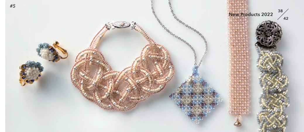
New Products 2022 38 / 42