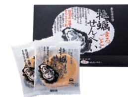
Confections/Snacks #10 Whole Oyster Senbei Crackers

Crispy senbei crackers made with high-quality potatoes and topped with an entire oyster