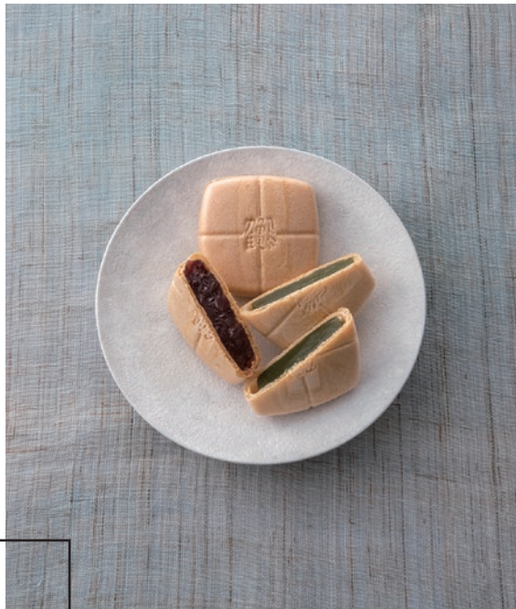
Confections/Snacks #7 Tsurukame Monaka

Embossed with the characters for crane and turtle , traditional symbols of good fortune