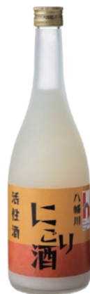
Drinks/Alcohol #2 Yahatakawa Kassei Nigori Sake

A refreshingly sweet sparkling nigori sake from a brewery with 200 years of history