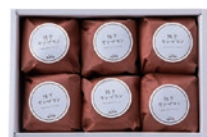
Confections/Snacks #11 Baked Mont Blanc

A sensational creation that's crispy on the outside and tender on the inside