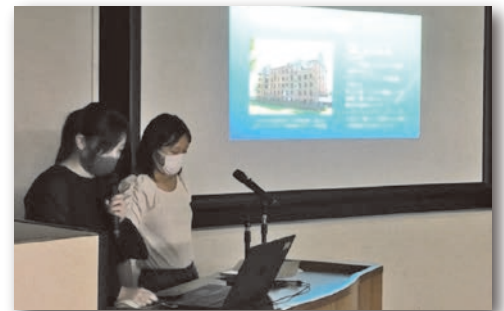
Introducing their research on the host city, Volgograd