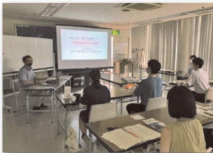
Studying international understanding

During pre-conference seminar, the eight participants successfully carried out the roles assigned to them. They conducted several discussions and considered how to proceed with the training, as well as the layouts of their presentations. Each of the participants, gathered together under the same objective, participated proactively in the seminar and helped cement awareness in one another that the development of the IYCPF was in their hands.