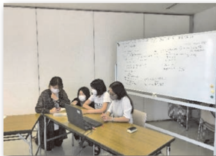
Preparing for the Hiroshima City presentation