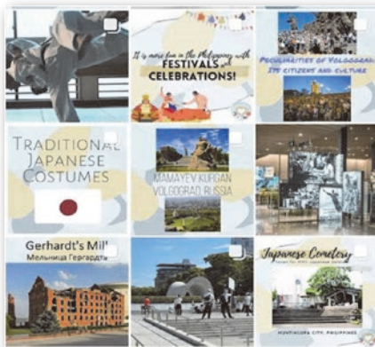
using social media for peace activities