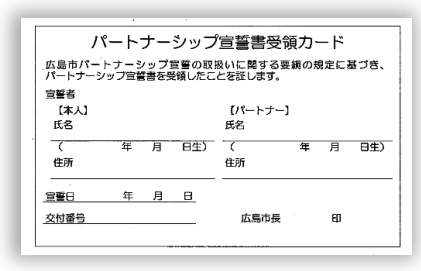
† Card (Some include a pattern)