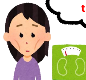
Sudden weight loss