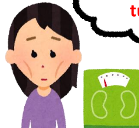
Sudden weight loss