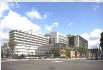
Fig.7 Hiroshima Citizen's Hospital

These are examples of facilities constructed on the land donated by the national government.