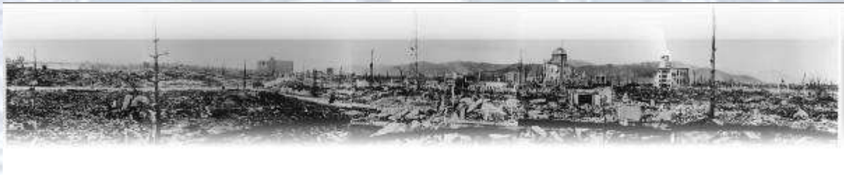
Fig.1 Panoramic view after bombing (Oct.1945-Mar.1946)

This article declares the meaning and import of this law. All peoples throughout the world seek genuine and lasting peace as an ideal. The intent of this law was to construct Hiroshima as a city that symbolizes lasting peace and Japan's renunciation of war.