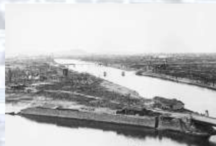
Fig.2 Nakajima District after bombing

The Nakajima District is located in the center of the City and lies between the two rivers, the Motoyasugawa and the Honkawa. It was formerly one of the city's main business districts. In 1946, much of this area was set aside as Nakajima Park under the Hiroshima