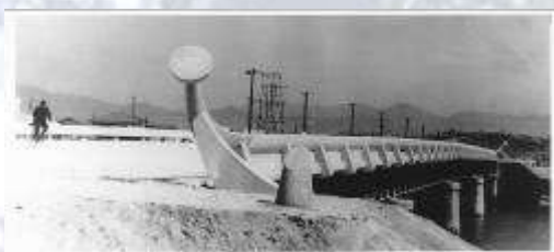
Fig.4 Heiwa-ohashi Bridge (1952)

In 1952, Heiwa-ohashi Bridge and Nishi-heiwa-ohashi Bridge were constructed under direct control of the national government. The railings of these bridges were designed by world famous Japanese-American Sculptor Isamu Noguchi .