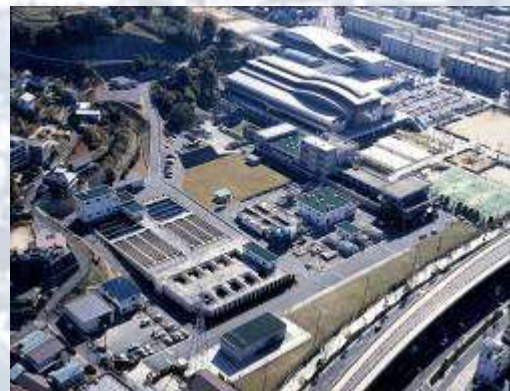
Fig.9 Hiroshima Big Wave and Ushita Filtration Plant