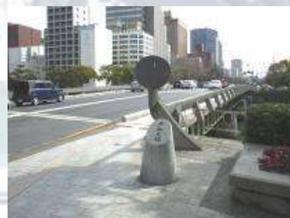
Fig.5 Present Heiwa-ohashi Bridge

In May 2000, Bank of Japan made a decision to donate land and building of former Hiroshima office to the City of Hiroshima without compensation on condition that this building is designated as a national important cultural property.