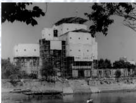
Fig.10 A-Bomb Dome under first preservation work (1967)

Preservation work of the A-Bomb Dome was carried out three times (1967, 1990, 2002) funded largely by the donations of private citizens. And, As well, Hiroshima Municipal Baseball Stadium was built in 1958 as center of sports with the donations of local financial circles.