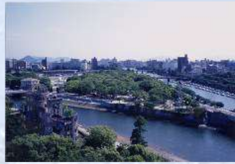
Fig.3 Present Nakajima District

In accordance with the Town Planning Law, the Park and the Atomic Bomb Dome were designated as a memorial to world peace.