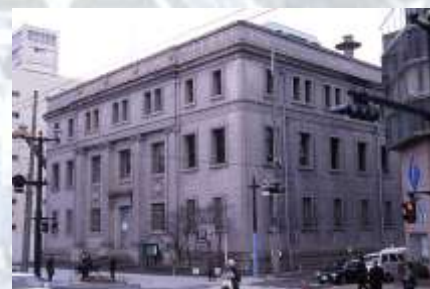
Fig.6 Former Hiroshima office of Bank of Japan

In May 2000, Bank of Japan made a decision to donate land and building of former Hiroshima office to the City of Hiroshima without compensation on condition that this building is designated as a national important cultural property.