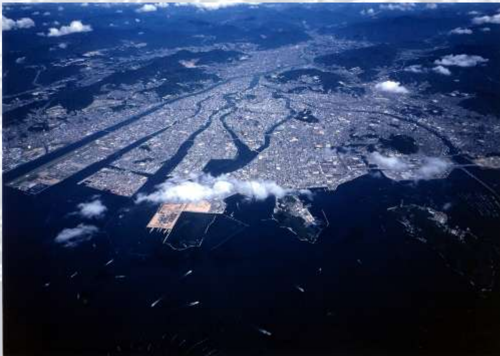
The City of Hiroshima

Hiroshima was reconstructed in accordance with the law and the plan, which even today serve as the basis for town planning.