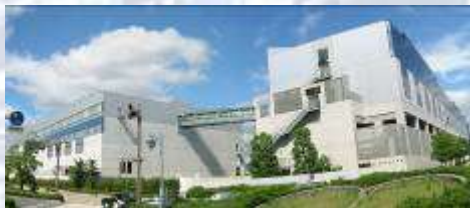
Fig.8 Motomachi High School