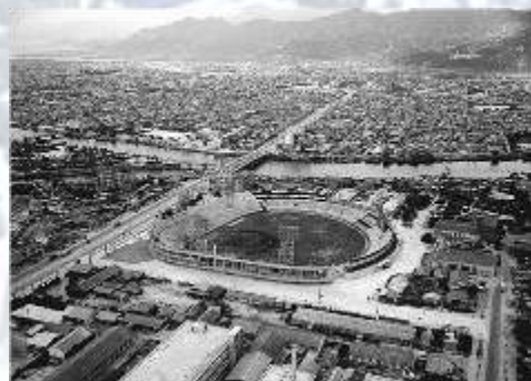
Fig.11 Hiroshima Municipal Baseball Stadium after completion (1958)