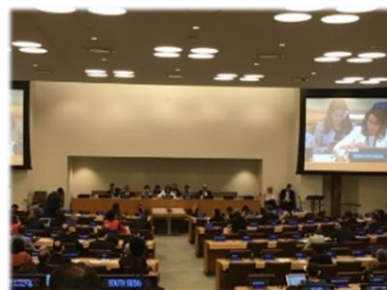
Conference to negotiate a prohibition treaty

The treaty opened for signature on September 20, 2017, and on October 24, 2020, the number of states ratifying the treaty reached 50, ensuring its entry into force. On January 22, 2021, 90 days after the 50th ratification, the treaty entered into force.