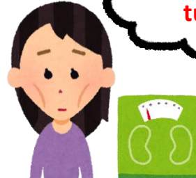
Sudden weight loss